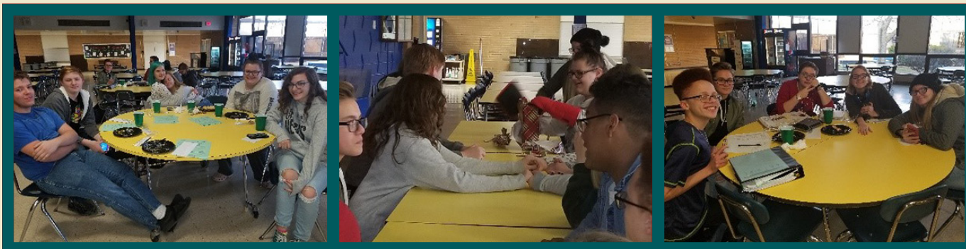
Jefferson High School Upward Bound Holiday Party – December 19, 2017