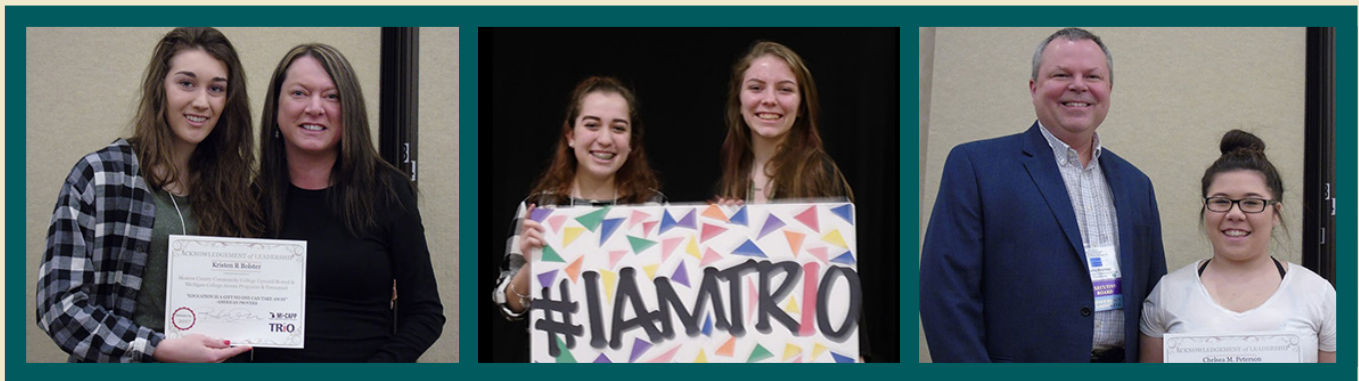
2017 Grand Rapids, Michigan

The Upward Bound/TRIO Student Leadership Conference is a yearly event. The Upward Bound staff have invited students from each school (Airport High School, Jefferson High School and Monroe High School) to attend this event. They will participate in team building activities with other students from across the state. They will also attend workshops covering topics such as leadership, goal setting, stress management, and financial strategies for paying for college. The weekend event tops off with a Dinner Banquet/ Scholarship Ceremony and a dance for the students.