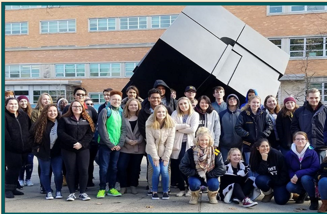
Upward Bound Students from Airport High School, Jefferson High School and Monroe High School