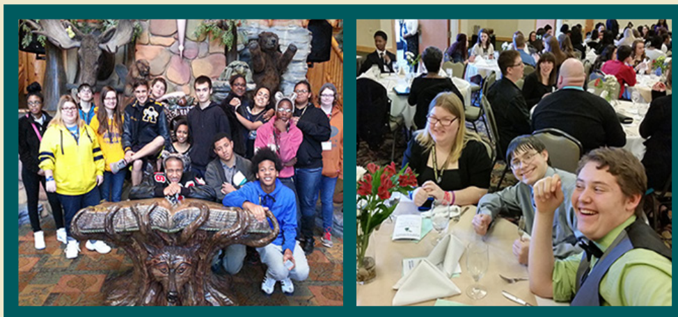
2015 Traverse City, Michigan

The Upward Bound/TRIO Student Leadership Conference is a yearly event. The Upward Bound staff have invited students from each school (Airport High School, Jefferson High School and Monroe High School) to attend this event. They will participate in team building activities with other students from across the state. They will also attend workshops covering topics such as leadership, goal setting, stress management, and financial strategies for paying for college. The weekend event tops off with a Dinner Banquet/ Scholarship Ceremony and a dance for the students.