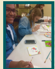
Upward Bound JHS Students at the Sofia Quintero Art and Cultural Center, January 31, 2018